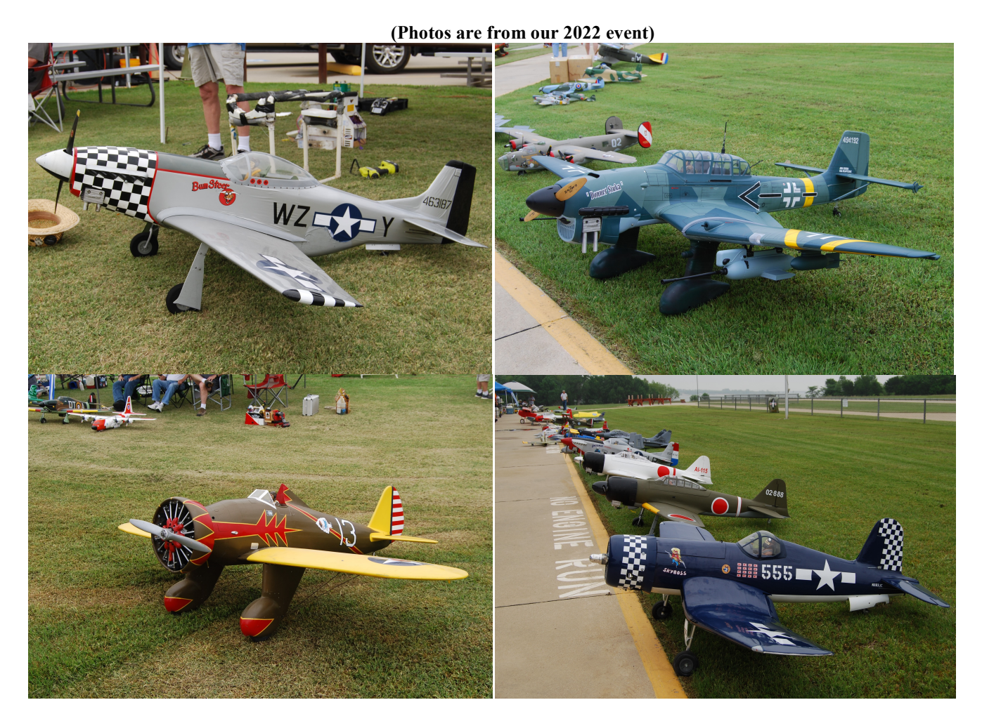
1/3-scale Stormbird Flies Again: by Debra Cleghorn

Our annual Warbird Fly-In was cancelled due to projected adverse weather conditions. Tentative plans are to hold it in the fall. More to follow.